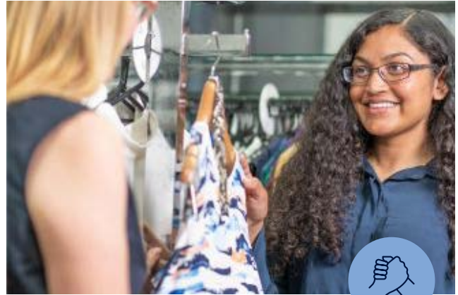
Dress for Success Perth – 2022 grant recipient