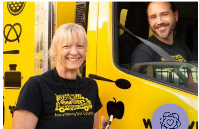
OZ Harvest WA – 2022 grant recipient