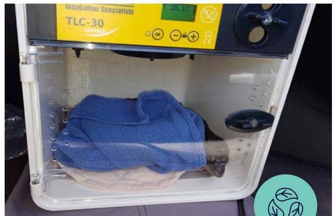
Bluebush Wildlife Rescue and Rehabilitation – 2022 grant recipient