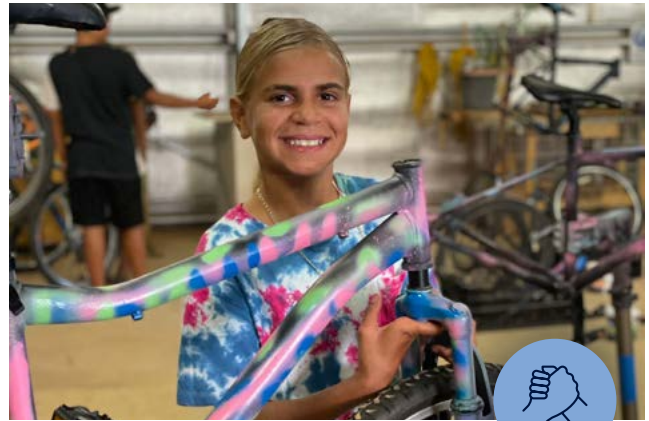
Dismantle BikeRescue Mullewa – 2022 grant recipient

There are also helpful hints and definitions throughout the online application form. We use SmartyGrants grants administration system.