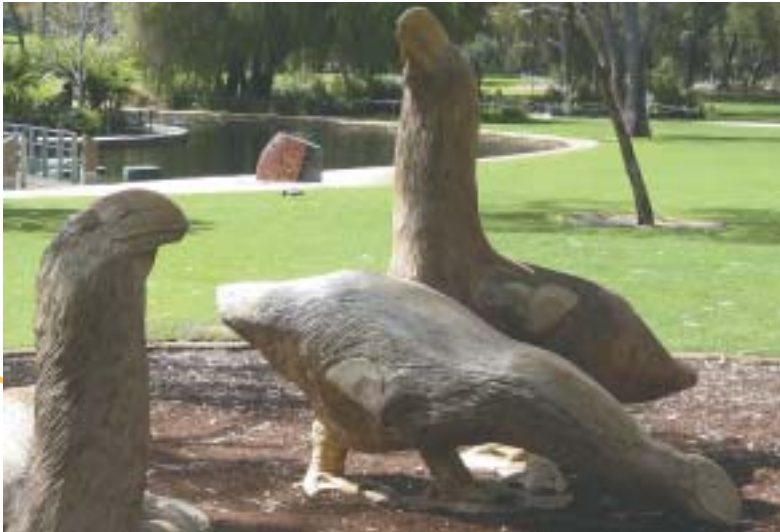
The Synergy Parkland.

LOOKING FOR OUTDOOR FAMILY FUN ON WEEKENDS OR SCHOOL HOLIDAYS? HERE ARE SOME GREAT IDEAS: